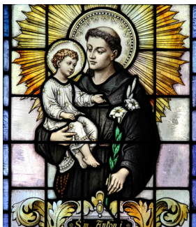
St Anthony of Padua