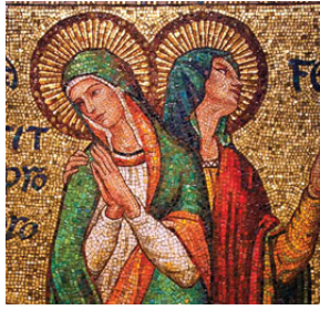
Ss Perpetua & Felicity