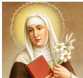
St Catherine of Siena