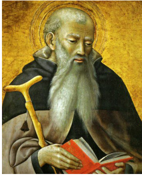
St Anthony of the Desert