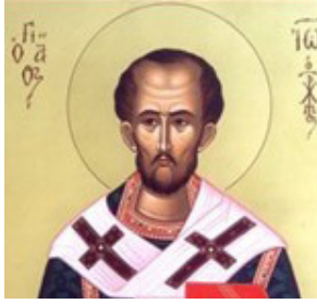
St John Chrysostom